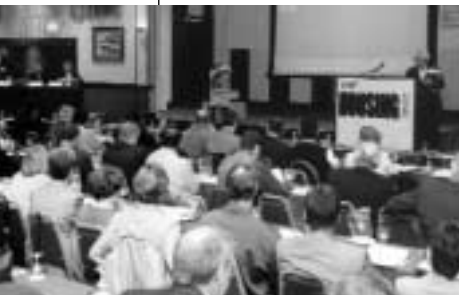
Delegates at the Annual Housing Practitioners Conference

The conference papers published by the Housing Unit were circulated to delegates, members of the local authority housing practitioner networks and interested groups in November 2000.