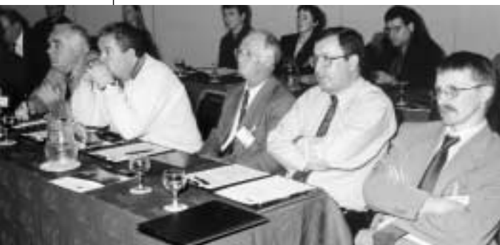
Delegates at the Annual Housing Practitioners Conference

Within this general aim the Housing Unit also works to achieve the following specific objectives: