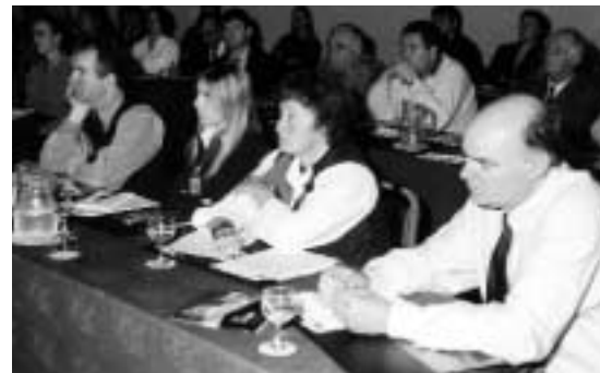
Delegates at the Annual Housing Practitioners Conference